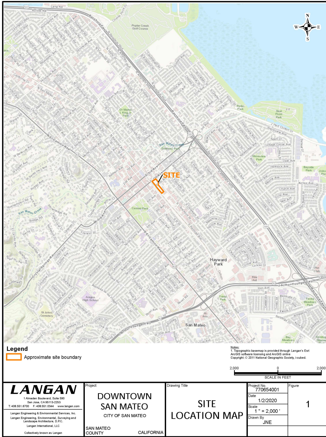
EXHIBIT A SITE LOCATION MAP